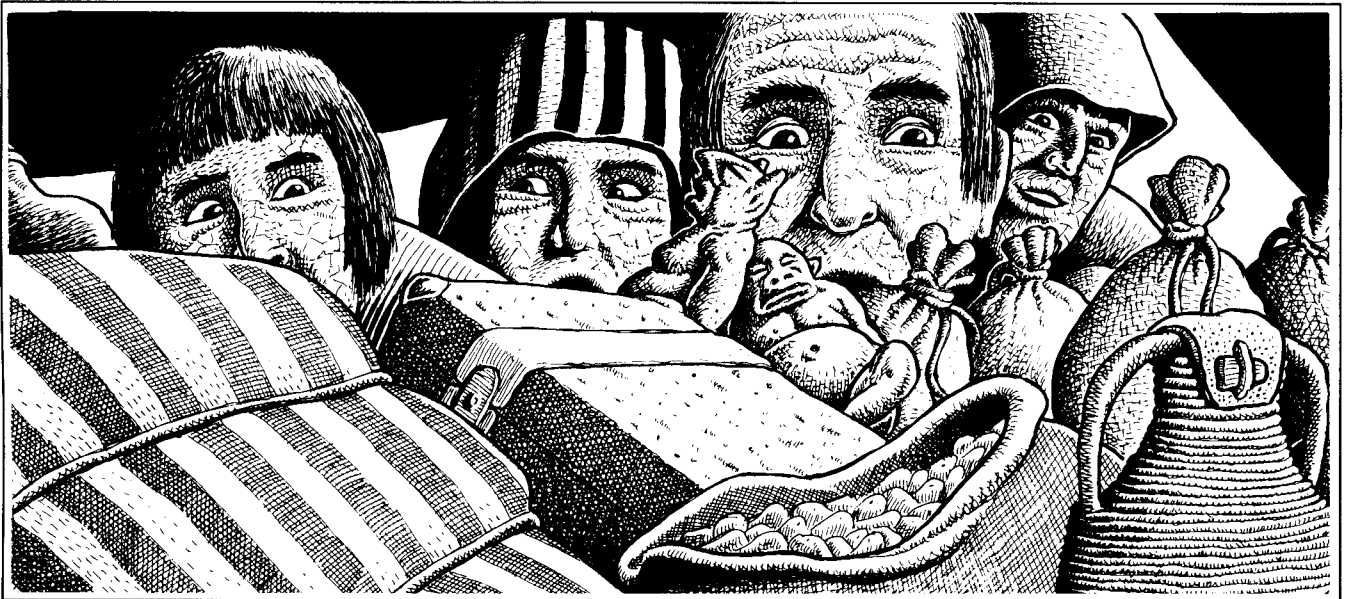
The lepers were excited to find food and many valuables left by the Syrian soldiers.