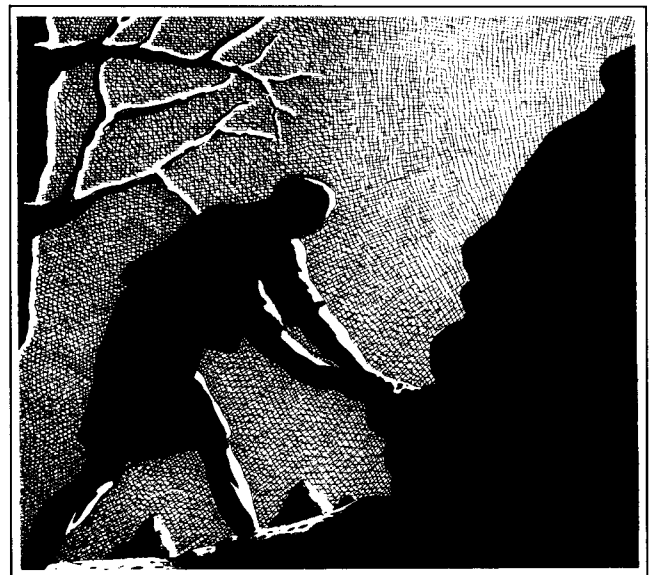
Gehazi quickly hid the money and clothing he had received from Naaman.

Gehazi was horrified. In a few seconds his skin became white with