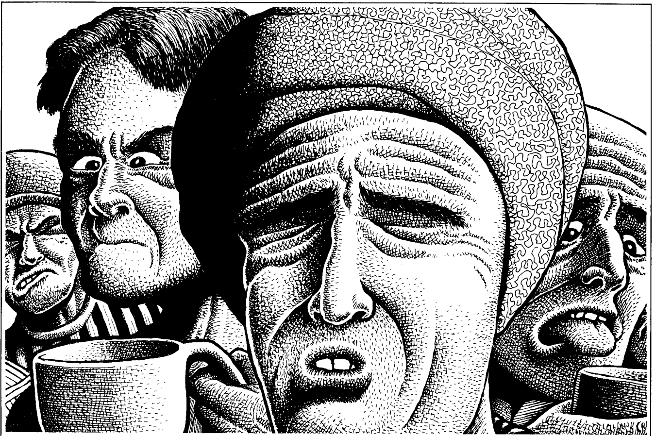
The men suddenly realized that the vegetable stew was poisoned.