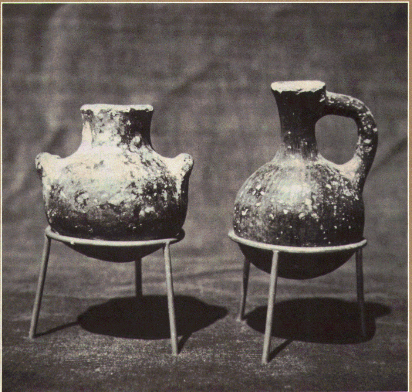
Elisha Succeeds Elijah