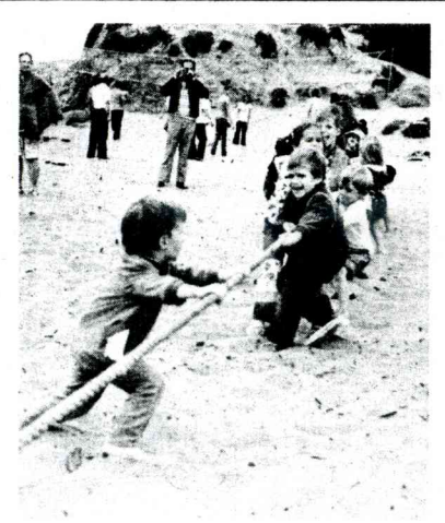
CHURCH PICNIC - Northern California's summer fog was late leaving this year, but high spirits, homegrown barbecued lamb and a tug-of-war in the sand, together with all the other fun, games and food, made a bright and sunny day of it Sept. 2 at the picnic of the churches from Fairfield and Santa Rosa, Calif. See story at right.