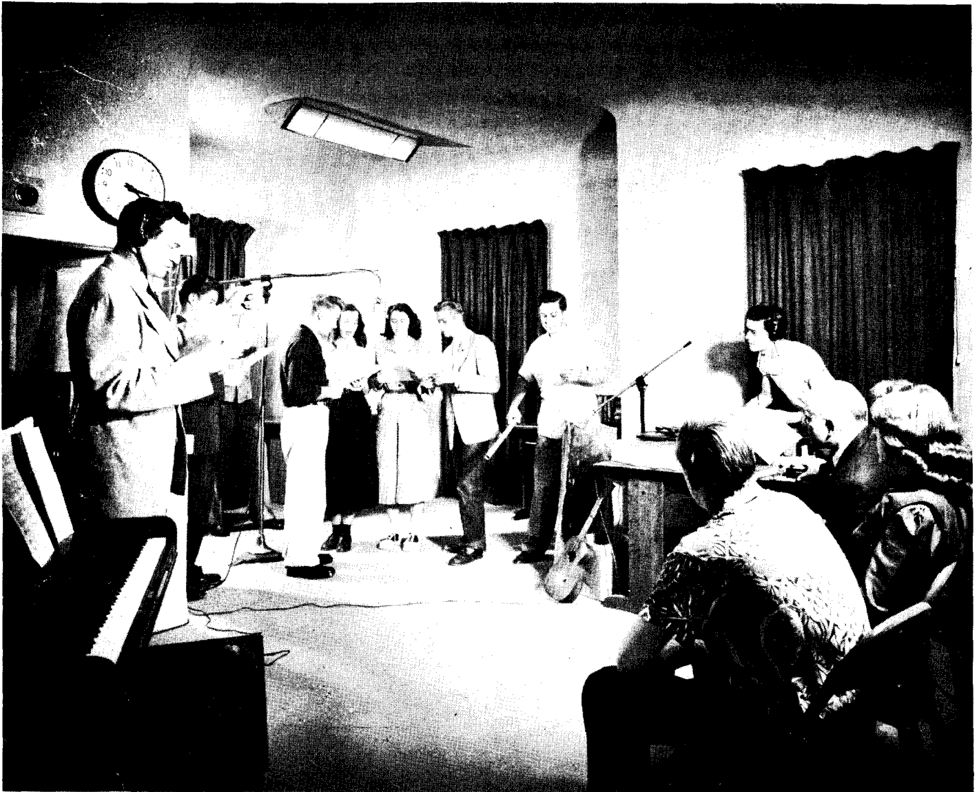
Broadcast Studio: Radio Drama being recorded.

the campus during the next five years. These plans contemplate erection of three new buildings and other changes, improvements and additions, which will provide Ambassador College with a truly fine and thoroughly adequate plant in every respect. Work is now proceeding on clearing and developing the new athletic field, adjoining the campus across Terrace Drive, to the east. We expect to have this in operation for softball by spring. The growth and development of Ambassador College during its four and a half short years is nothing short of miraculous.