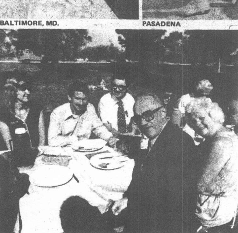
LONG BEACH, CALIF.