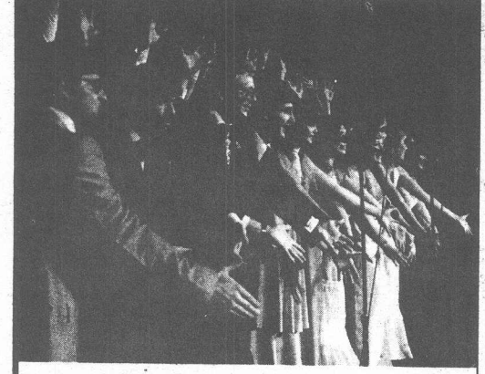
STAGE PERFORMERS — Ambassador students perform in unison during the college's Thanksgiving dance Nov. 23 in the Student Center.