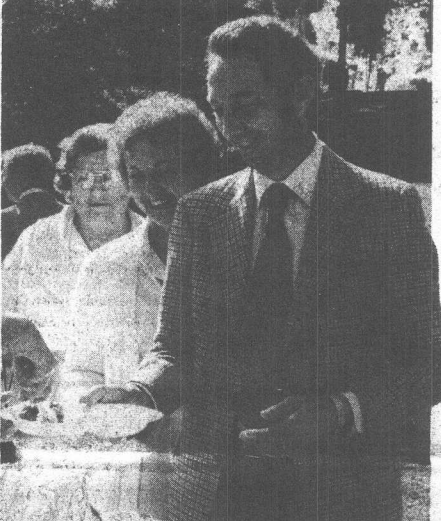
OKLAHOMA CITY, OKLA.